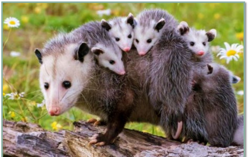
National Wildlife Federation

https://www.smithsonianmag.com/smart-news/high-temperatures-make-some-ticks-pick-humans-over-dogs-180976372/?utm_source=smithsoniandaily&utm_medium=email&utm_campaign=20201123-daily-responsive&spMailingID=43968529&spUserID=OTMyMDQ0MDA0OTMzS0&spJobID=1881953888&spReportId=MTg4MTk1Mzg4OAS2